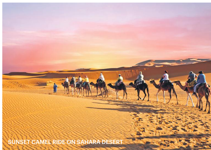
SUNSET CAMEL RIDE ON SAHARA DESERT

Jemaa el Fna Square (People Assembly), which was declared a World Heritage Site. In the late evening, transfer to "CHEZ ALI" for dinner and enjoy a performance consisting of splendid dramatic display of Arabian nights, belly dancing and folklore.