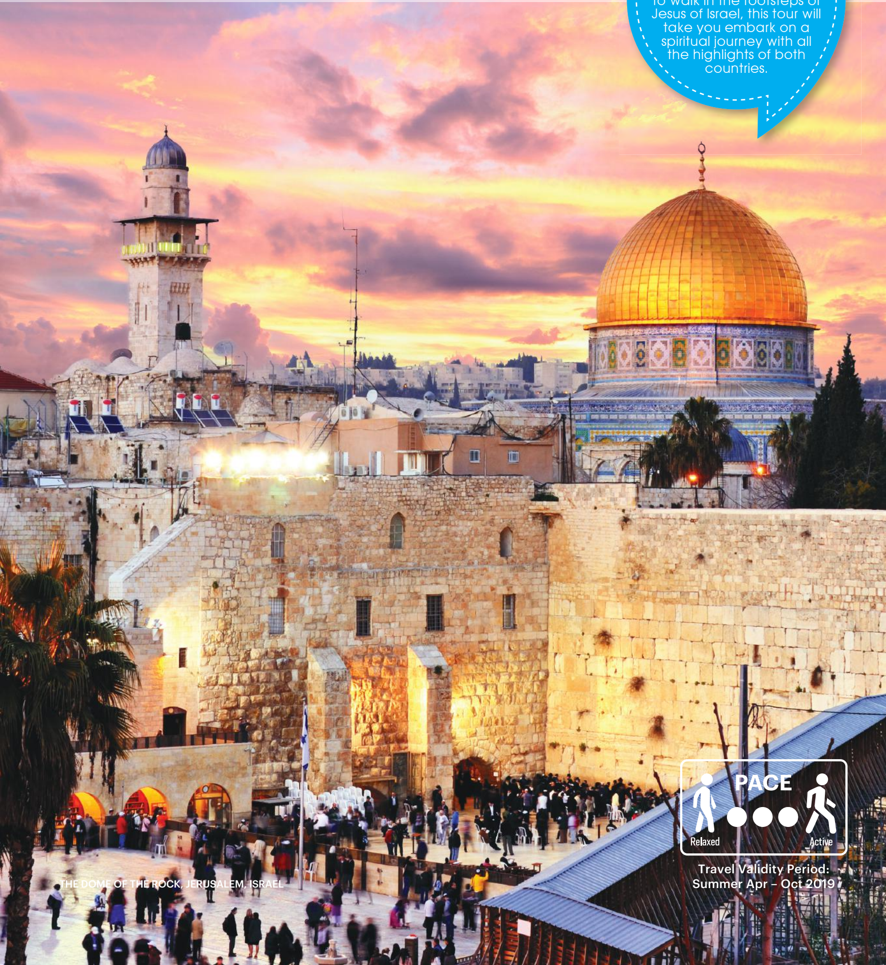
THE DOME OF THE ROCK, JERUSALEM, ISRAEL

FOLLOW US.... From the rich Arab culture and ancient sites of Jordan to walk in the footsteps of Jesus of Israel, this tour will take you embark on a spiritual journey with all the highlights of both countries.